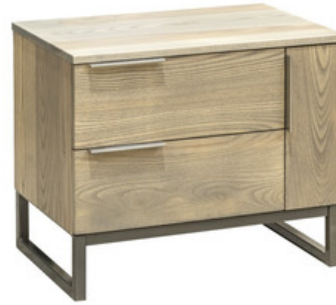
2 DRAWER, 1 DOOR BEDSIDE