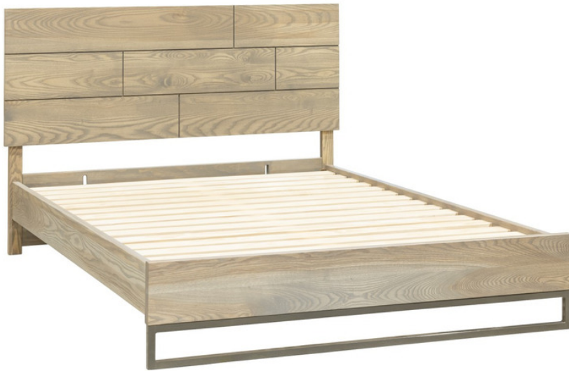
QUEEN DUVET FOOT BED