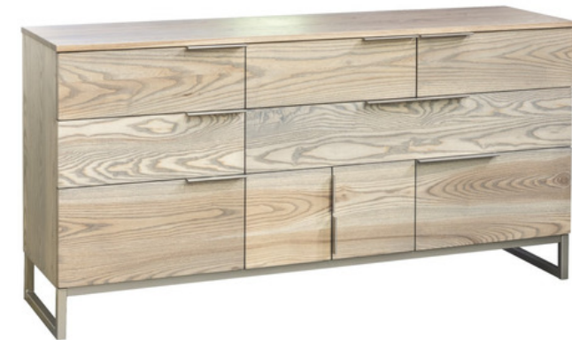
9 DRAWER LOWBOY