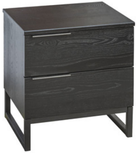
2 DRAWER BEDSIDE TABLE