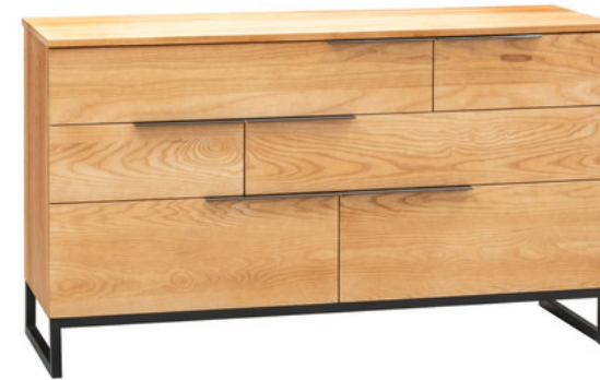
6 DRAWER LOWBOY