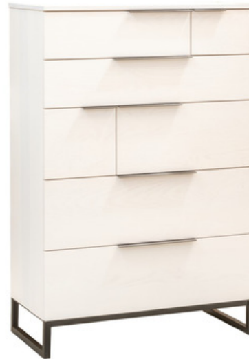
7 DRAWER CHEST

1830W x 1140H x 50D & Super King - 2010W x 1140H x 50D